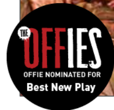
Casualties 2013 at Park Theatre, Photo by Simon Annand