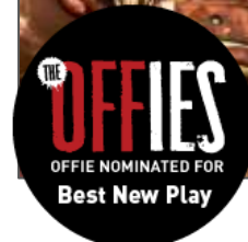
Casualties 2013 at Park Theatre